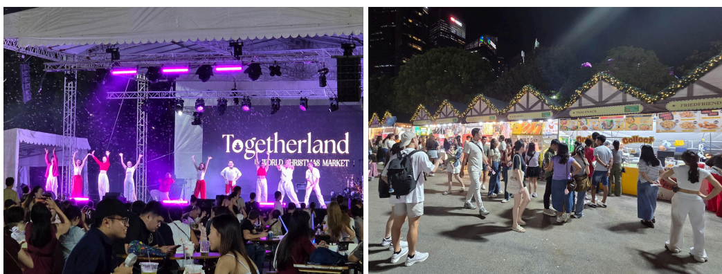
Togetherland by World Christmas Market