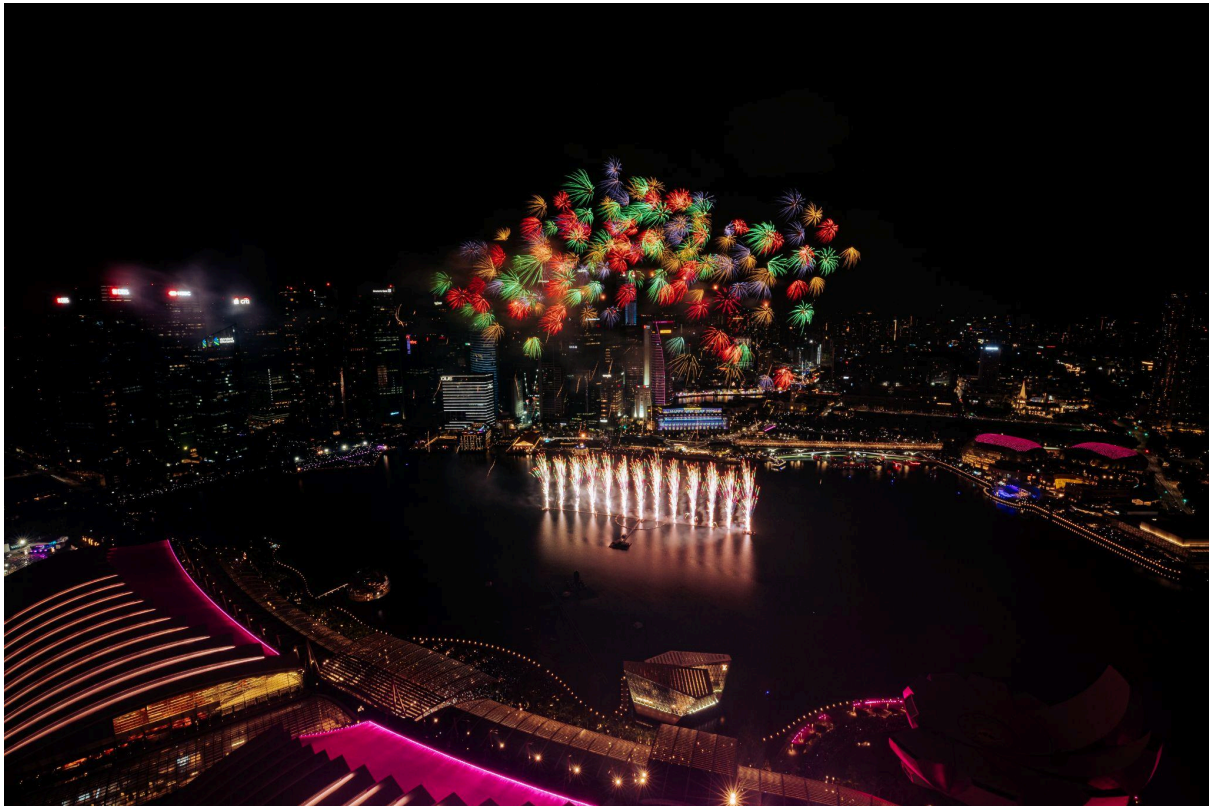
Fireworks Display - City in Nature